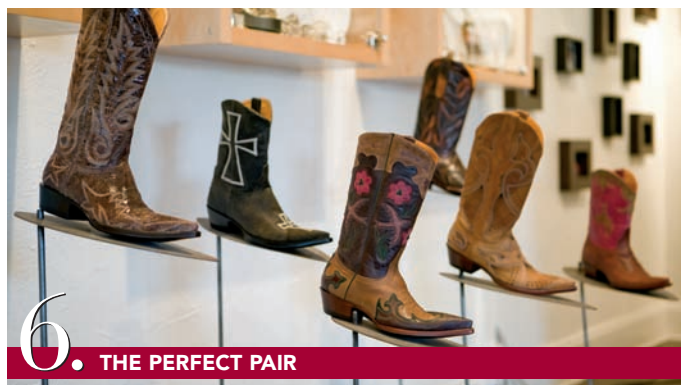
6. THE PERFECT PAIR