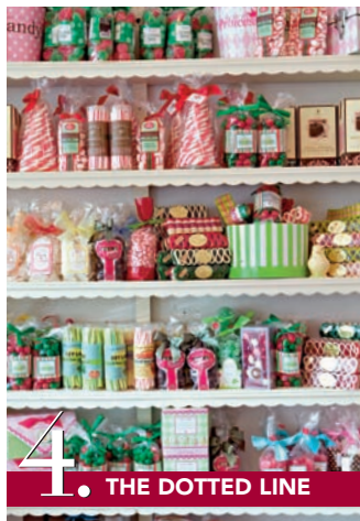
4. THE DOTTED LINE