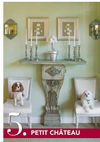
5. PETIT CHÂTEAU