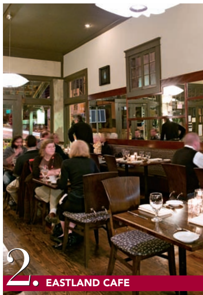
2. EASTLAND CAFE